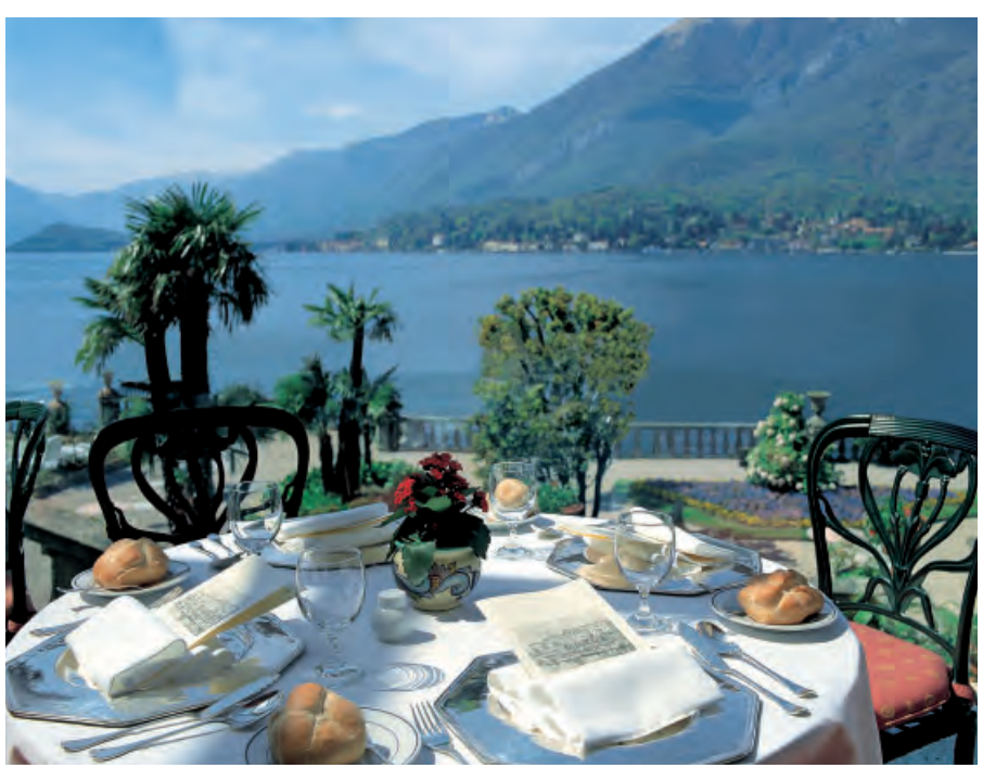
Villa Serbelloni, Bellagio