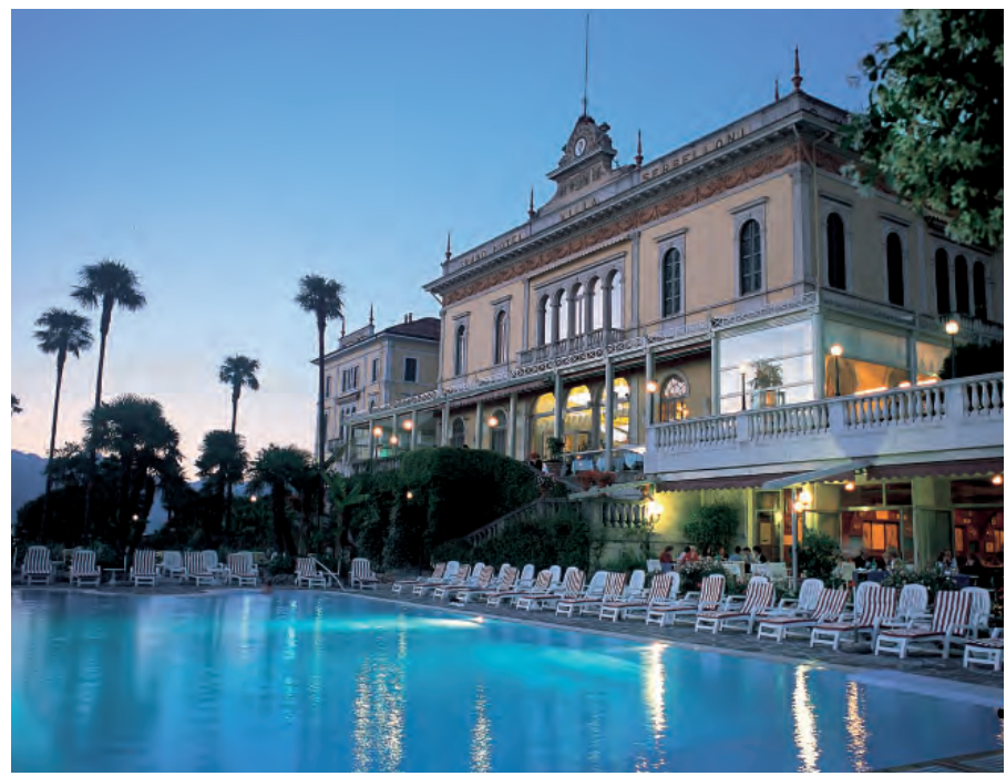
Villa Serbelloni, Bellagio

Hotel Angleterre et Residence 4 star On the shores of Lake Geneva with stunning view of the Alps, this hotel comprises of five different buildings surrounding the main Reception. The hotel offers contemporary style in a historic setting with parts of the buildings dating back to the 18th century. The 75 bedrooms and Junior Suites are scattered between four buildings, each with their own distinct styles, but all guests will benefit from the same high standards of care from the friendly, professional staff.