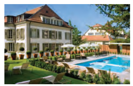
Hotel Angleterre et Residence, Lausanne