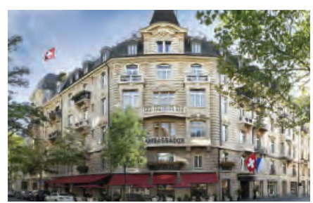
Hotel Ambassador a l'Opera, Zurich